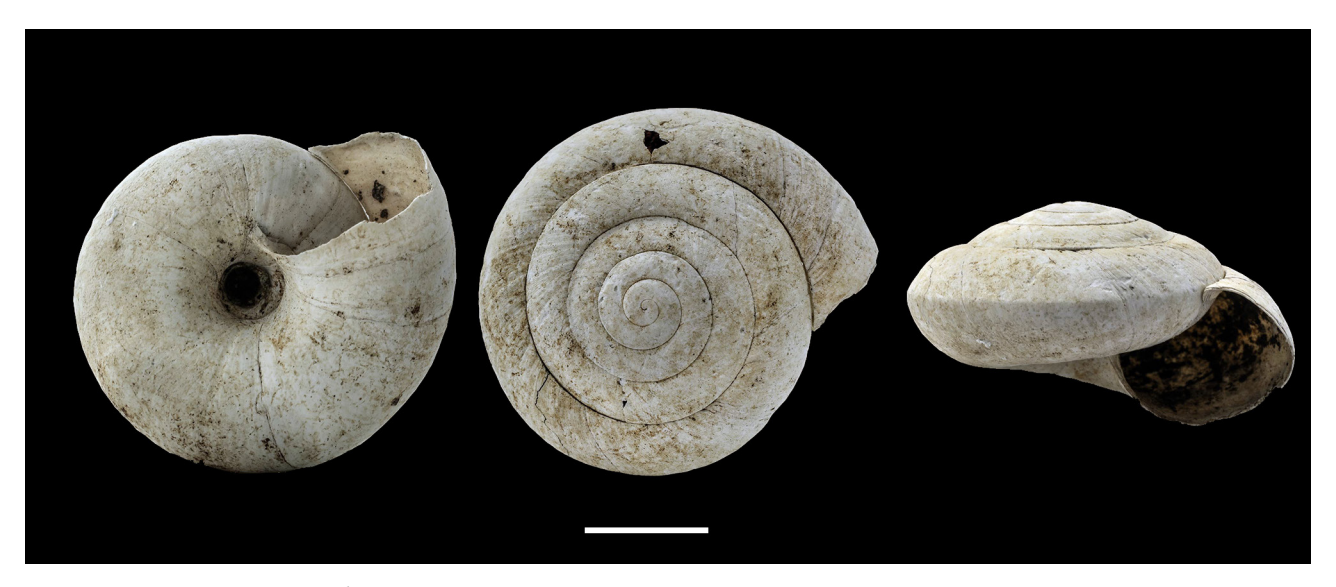
Fig. 2. The shell of Z. pergranulatus Kobelt, 1878 that was found on Paros island. Scale bar 10 mm